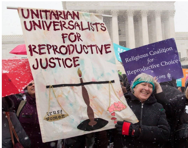
UUs have a special opportunity to present faith-based arguments for reproductive justice.

We advocate for the ability of all families and communities to realize a sense of wholeness with regard to their sexual and reproductive lives. We create safe and healthy environments for children in our faith communities and campaign publicly for just and compassionate laws for family planning, reproductive and sexual health, and gender equity.